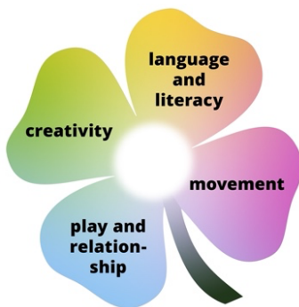
Figure 1: Four fields of experiences

In the MegaMarie plus programme, a four-leaf clover symbolises experiences and ways of expressing themselves that are highly significant for children in the first years of life: «play», «literacy», «creativity» and «movement» (Figure 1).